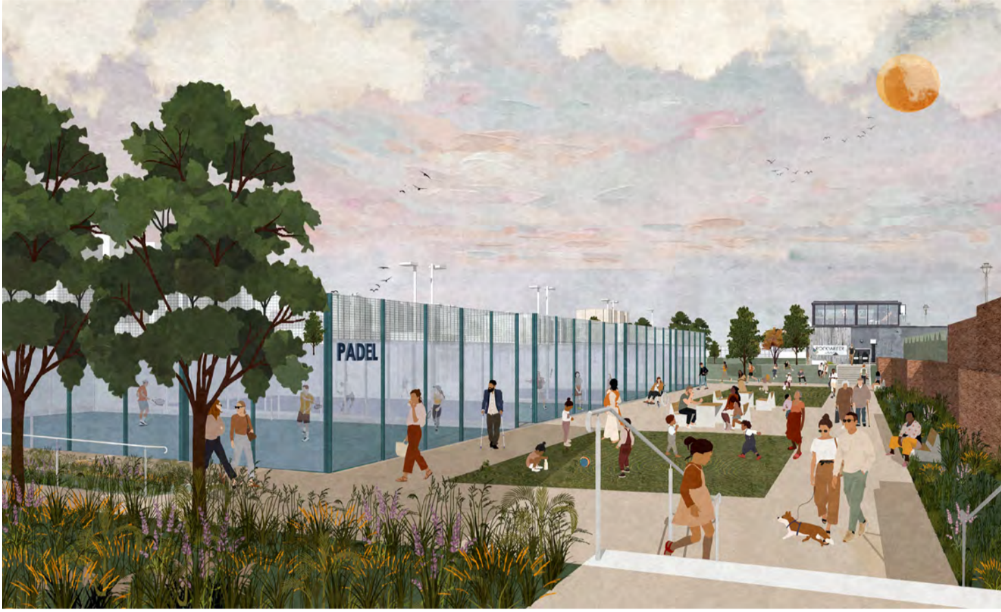
View looking east of new Padel Tennis Courts, with Rockwater in background