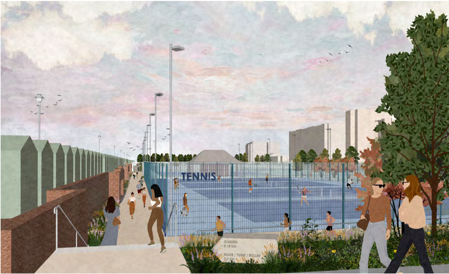
View west along accessible route beside Tennis Courts