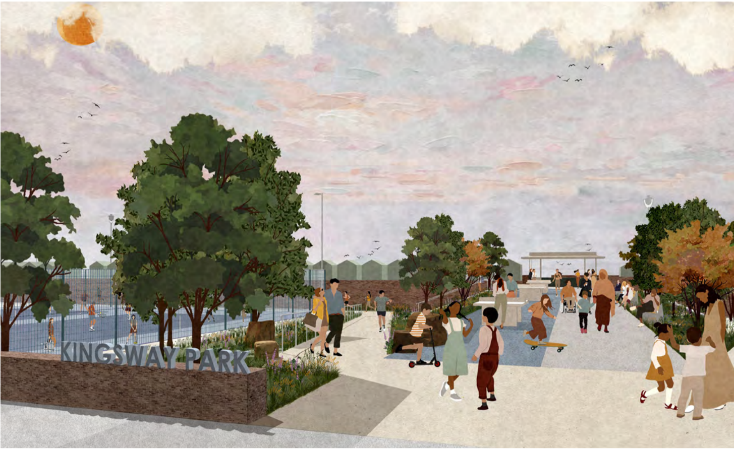
View south of Park entrance from Kingsway towards the Esplanade