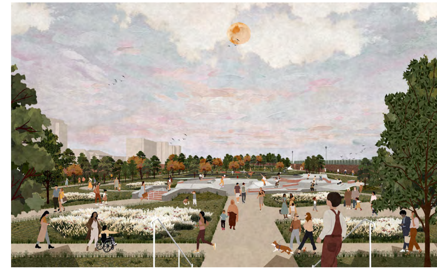
View east from new entry into Skate Park / Pump Track / Roller Plaza area

- Key existing park uses like Tennis, Bowls and Croquet are all retained, and complemented by new uses including Padel Tennis, Beach Sports, and 'Wheeled' Sports