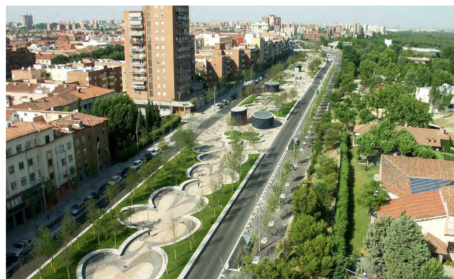
Madrid Rio - a linear park with outdoor 'rooms' framed by new soft landscape