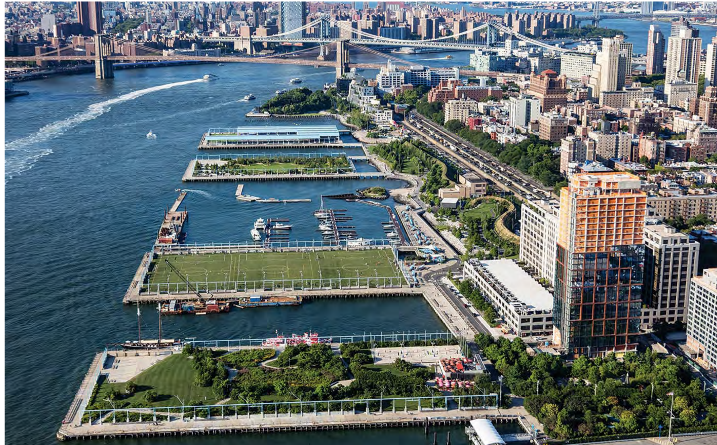
Brooklyn Bridge Park, NYC - wide-ranging community leisure and recreation provision across an extensive waterfront site, now a major local destination