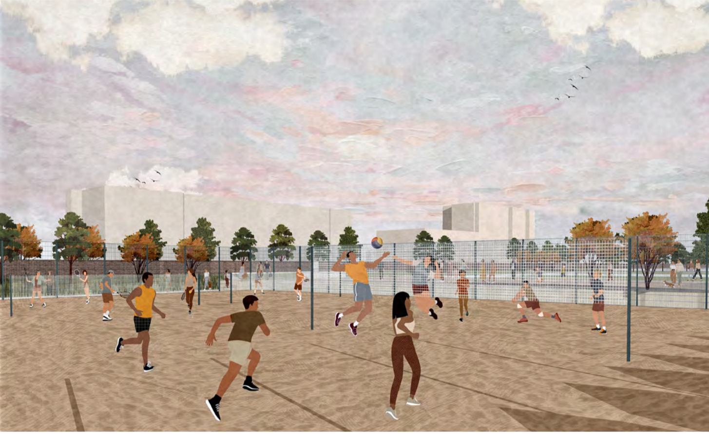
View looking north-east in new Beach Sports area, showing Volleyball and Tennis