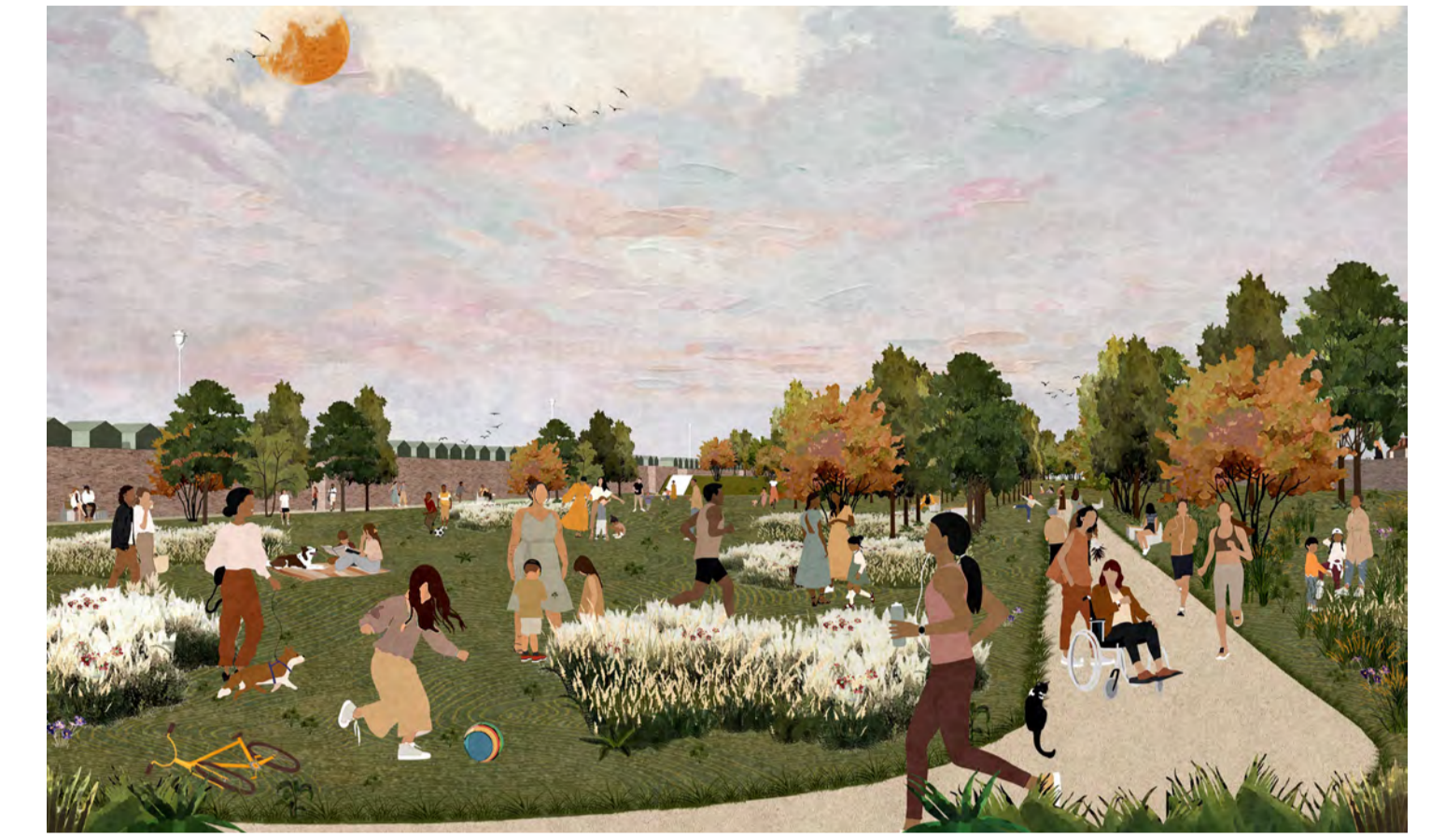
View looking south west across new Park Garden